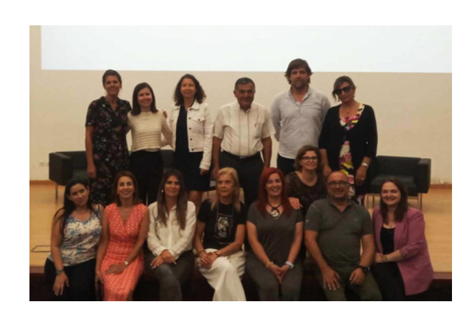
NSB Partners at the end of the Final Multiplier Event (Vila Verde, Braga (PT))

Upon the conclusion of this innovative project, NSB partners cannot help but to feel proud for all of the work done through fruitful collaboration between them, and for the results achieved, which for sure will have a positive impact on the quality of the training and learning environments in VET and in non-formal and informal learning contexts, contributing for motivating Gen Z students to continue their learning pathways towards a brilliant professional future, while preventing early school dropout rates.