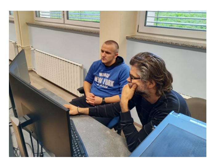
Student working with SERS Maribor Teacher in the design of the NSB App

Furthermore, students were often involved in the process of developing NSB results, namely the NSB App. Considering that this project result is targeted at them, it only made sense to include students in the design of the App and in testing it, as illustrated in the following pictures: